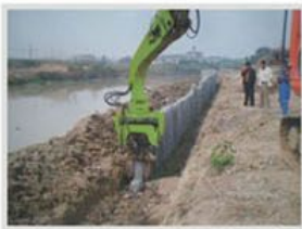
水泥桩 Concrete pile

Because of its small size and simple operation procedure, it can be applied for a wide range of working environment: such as drainage maintenance, river-bank maintenance and marshland working wherever onshore and offshore piling job.