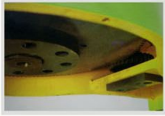
360度转盘 360degree Rotation Gear Box