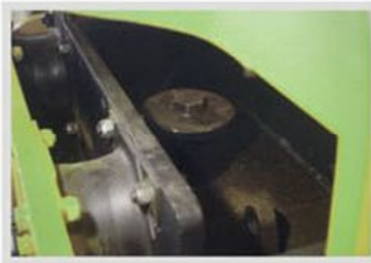
通气口 Air Vent