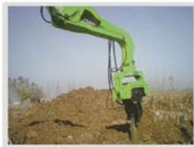
钢板桩 Sheet pile