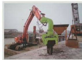
木桩 Wooden pile