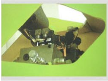
液压油路系统 Hydraulic Oil System