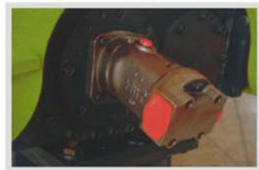
主机液压马达和齿轮箱 Vibrating Motor and Vibrating gear box