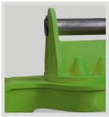
固定架 Mounting Bracket